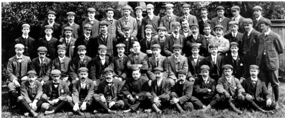
The Photo of club members was taken at a SCCU meeting in Bushey Park c. 1910

If you would like one then please make a sensible offer to Val Peachey.